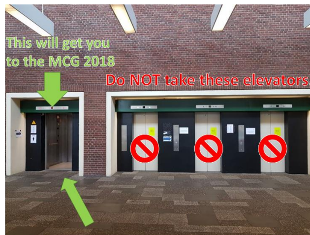
Figure 2 Elevators

Once you reached the 3 rd floor follow the signs to room H3006 in Section 3 C of the building.