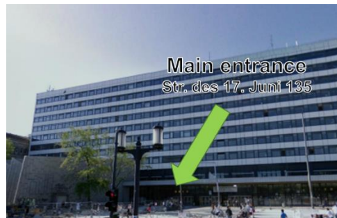
Figure 1 Main entrance of TU-Berlin

You will get there with your chosen mode of transport if you follow this link: